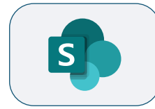
Microsoft SharePoint Online